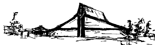
holy cross church garden head rd. vesuvius, b.c.

Masks are now mandatory for everyone in the Church and the parish centre.