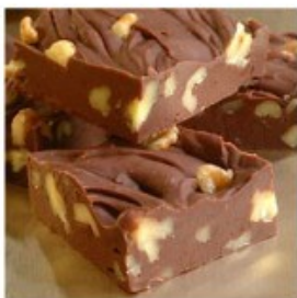
CHOCOLATE WALNUT: a softer, sweeter, more traditional fudge