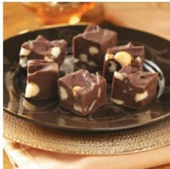
MACADAMIA MADNESS: dark chocolate, macadamias (size is a little smaller as the nuts are pricey)