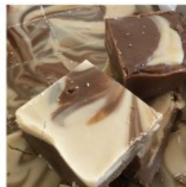
ROOT BEER FLOAT: a very pretty fudge, decadent chocolate with the taste of Root Beer over ice cream!

CHOCOLATE APRICOTS: hand-dipped, dried Apricots. A tarter taste for those who like their chocolate less rich. $3