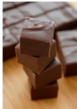
MIDNIGHT MINT: silky dark chocolate with a hint of crème de menthe (no alcohol)