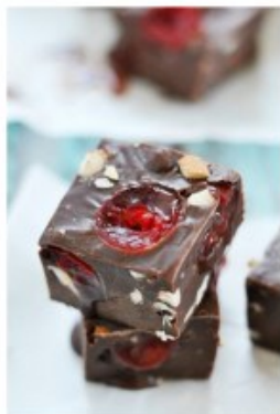
BLACK FOREST: our best-seller, dark chocolate, cherries almonds

All Birthright Fudges* are $5 (each package = 1/4 of an 8 inch square pan).