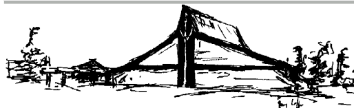
holy cross church garden head rd. victoria, b.c.

Masks are now mandatory for everyone in the Church and the parish centre.