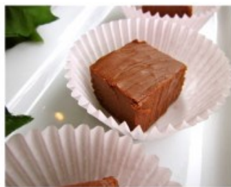
CLASSIC CHOCOLATE: softer, sweeter, more traditional, (no nuts but prepared in a home kitchen ~ trace amounts may be present)